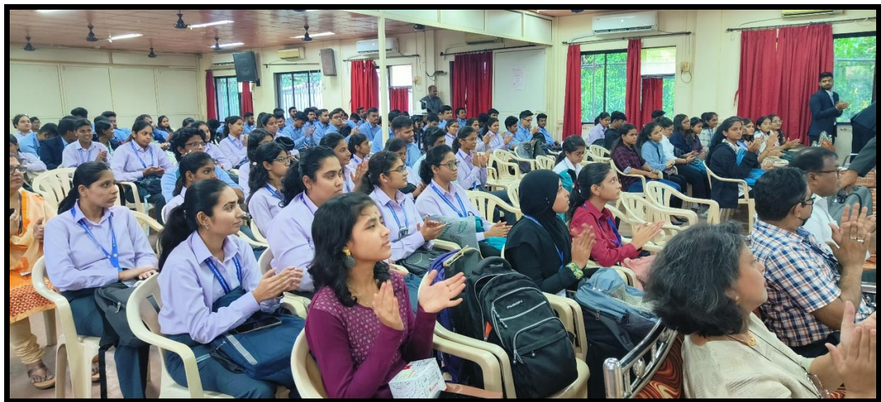
Audience enjoying the programme