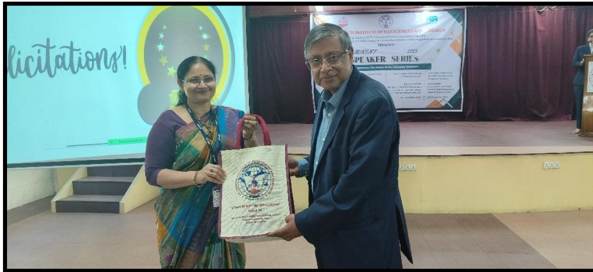
Token of Gratitude