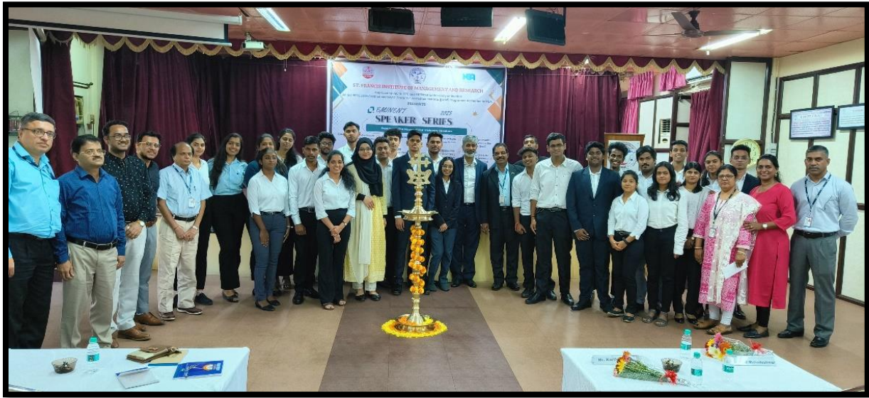
Speaker Series 2023 Student Coordinators and Faculty Members