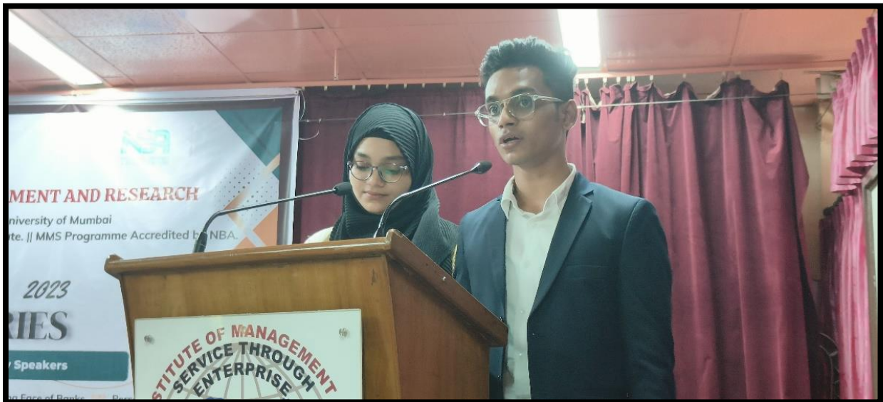
Comperer of Day 1