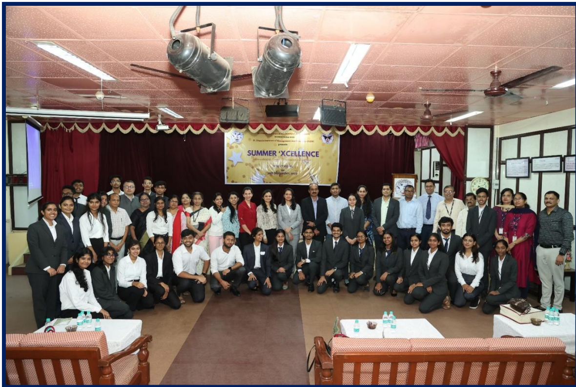
Team of Participants and Event Coordinators