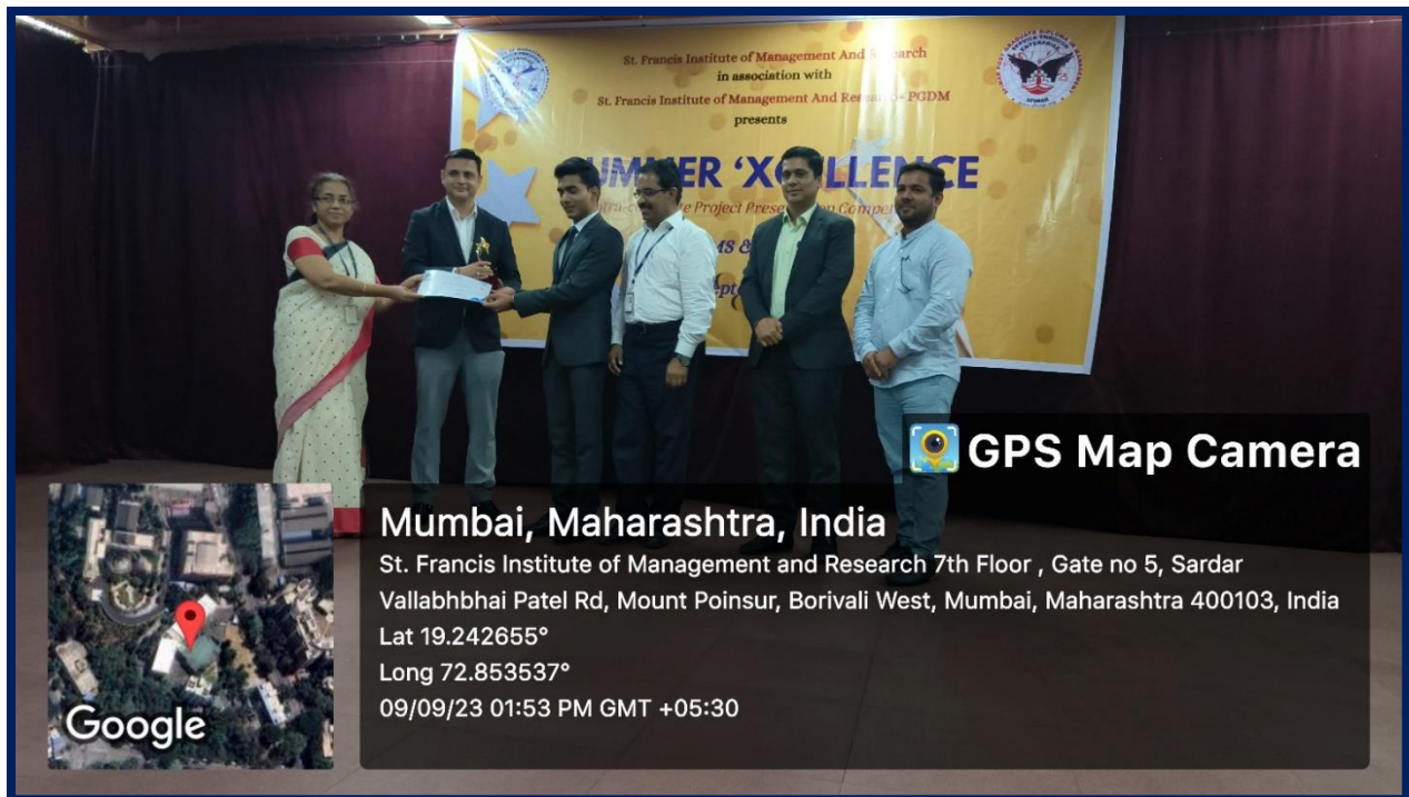
Finance- Panel 2 Winner