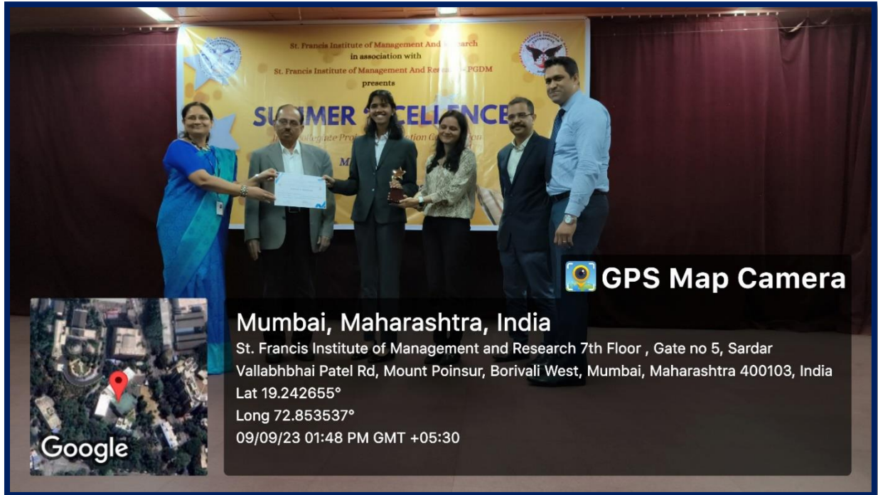
Finance- Panel 1 Winner